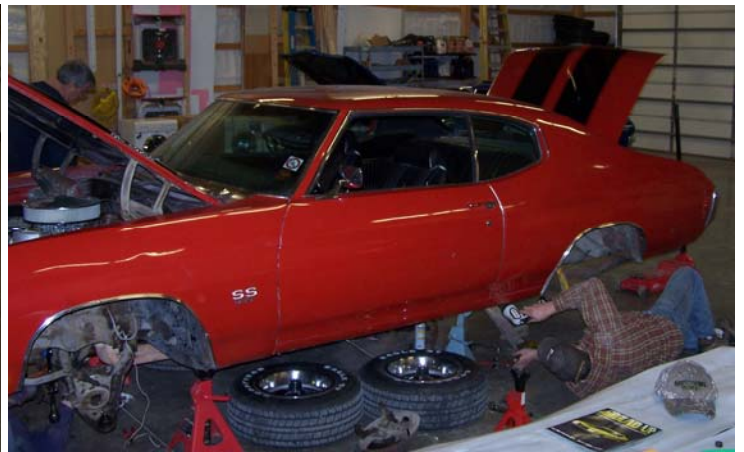
Ron Brightwell tackling removal of the differential.