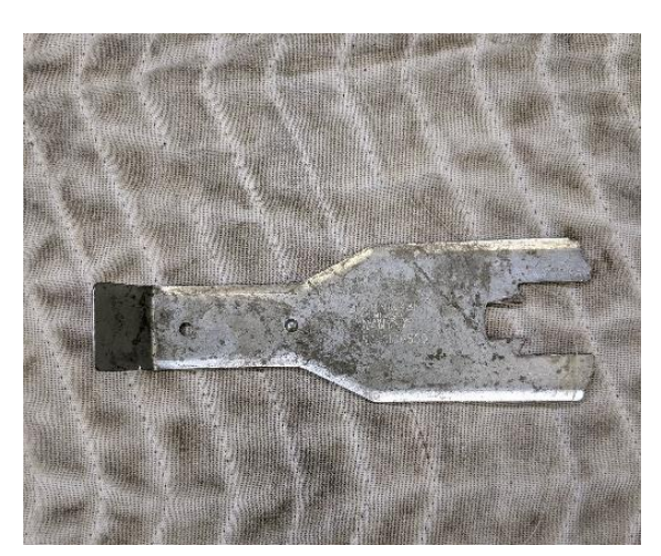
Door Handle Clip Remover