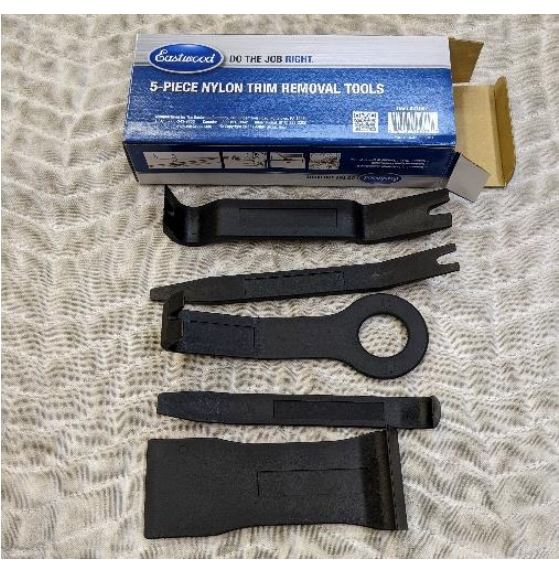
Trim Removal Tools