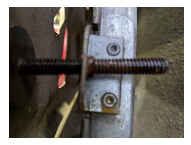
Lower channel adjusting stud (#17) NOTE POSITION