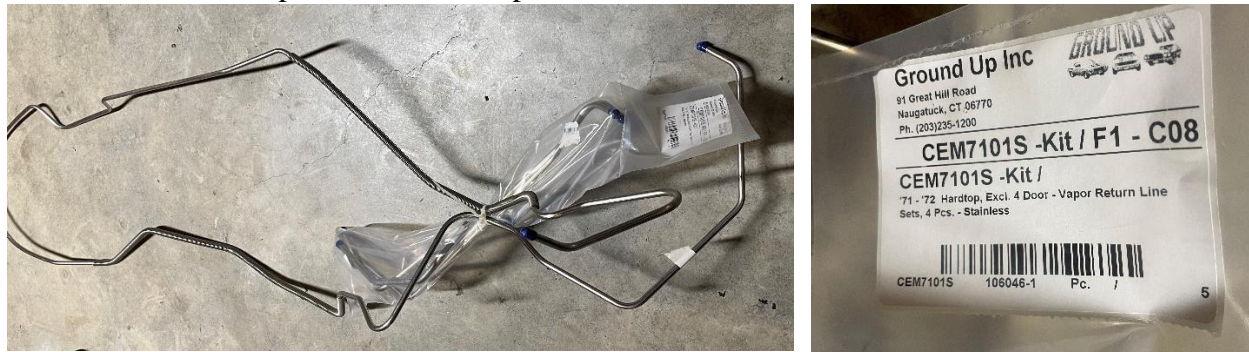
New 1971-72 Hardtop stainless steel 4-piece vent line set. $70

Four 15x7 five spoke wheels. Never installed since professionally painted. Stainless trim rings in fair condition. $300