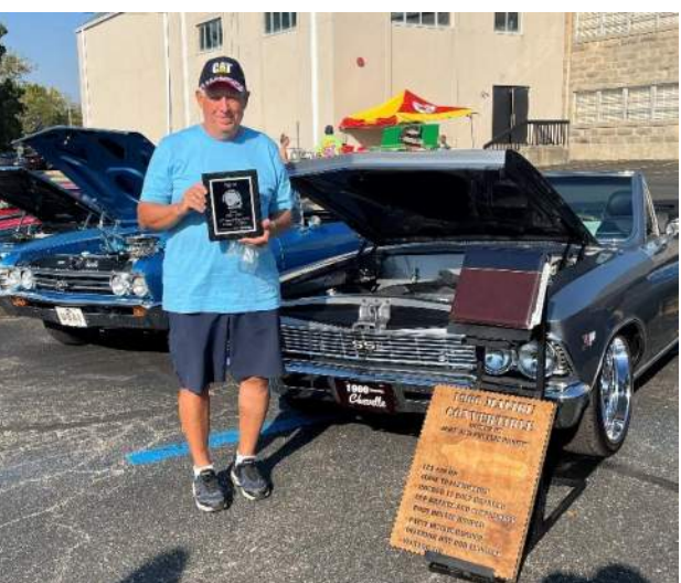
October 19: Cars in the Park, Lenexa, KS