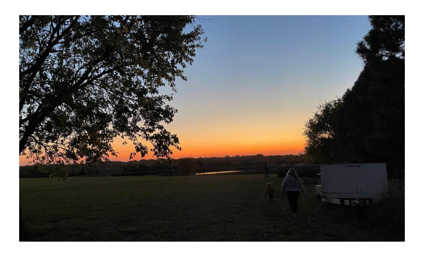
October 26: MACC Fall Color Tour to Fort Riley, KS

Scenic country roads and unusual Halloween decorations were some of the amenities enjoyed by the participants of this annual fall tradition on a beautiful autumn day. Five members of the MACC drove their vintage vehicles. While on the base, the club toured the Calvary and Infantry museums, in addition to viewing the many limestone buildings during the drive. A car tour is not complete without a good meal, and this one was no different. Moe's BBQ in St. George, KS (a few miles east of Manhattan) served up some tasty ribs, burnt ends, catfish, southern-style chicken and many delicious and unique sides.