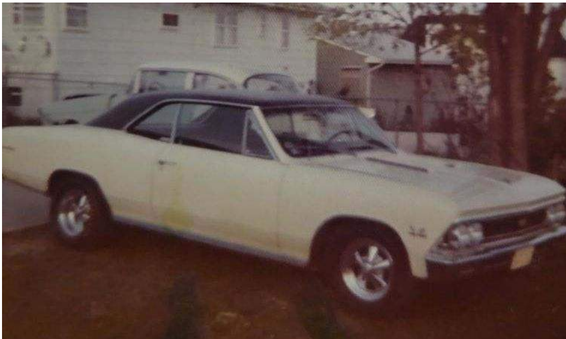
The high school cruiser (notice the family '55 in the background)

In high school I was a proud kid with a Super Sport Chevelle. Life was good and many great memories were made with my buddies working on our cars and cruising HiBoy's on Noland Road and Peter's Drive Inn on State Avenue. A few drag racing passes down KCIR were also made. After heavy persistence from a good friend, I sold my Chevelle to him. He immediately installed headers and an L88 cam, making it a great street performer in the KC Northland.