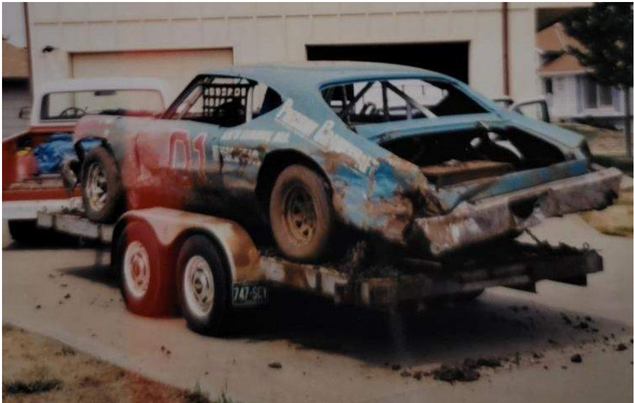
Some post-race damage