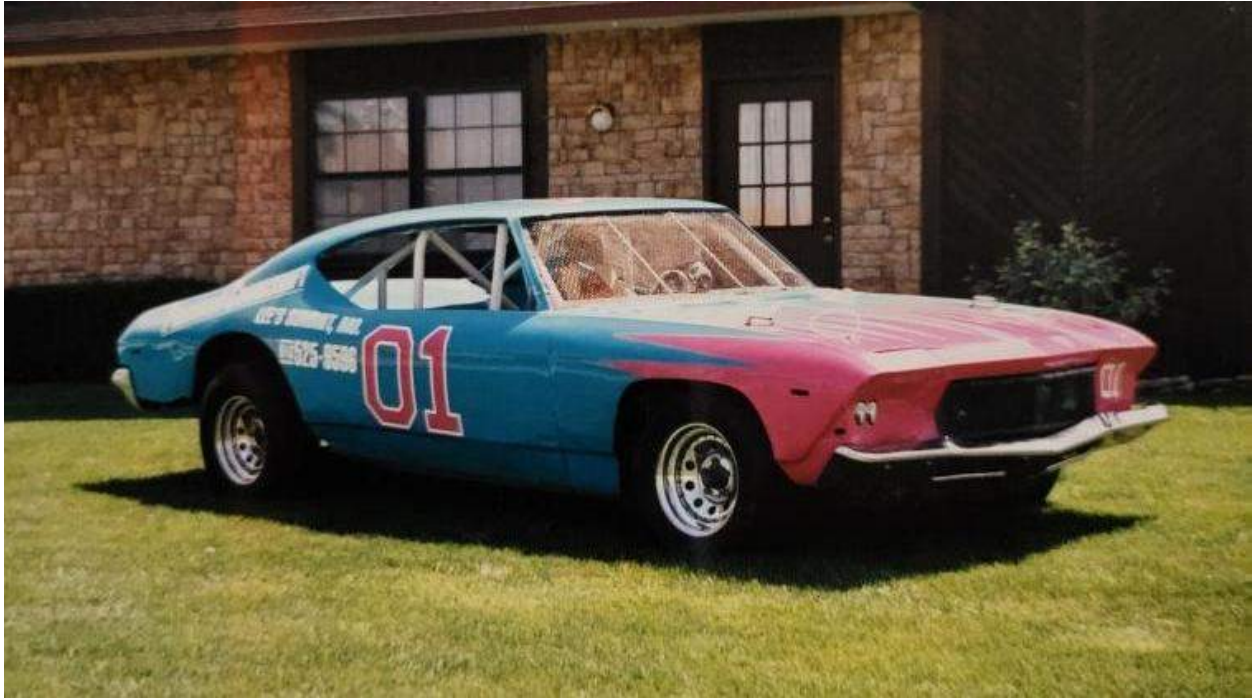
The '69 dirt track racer