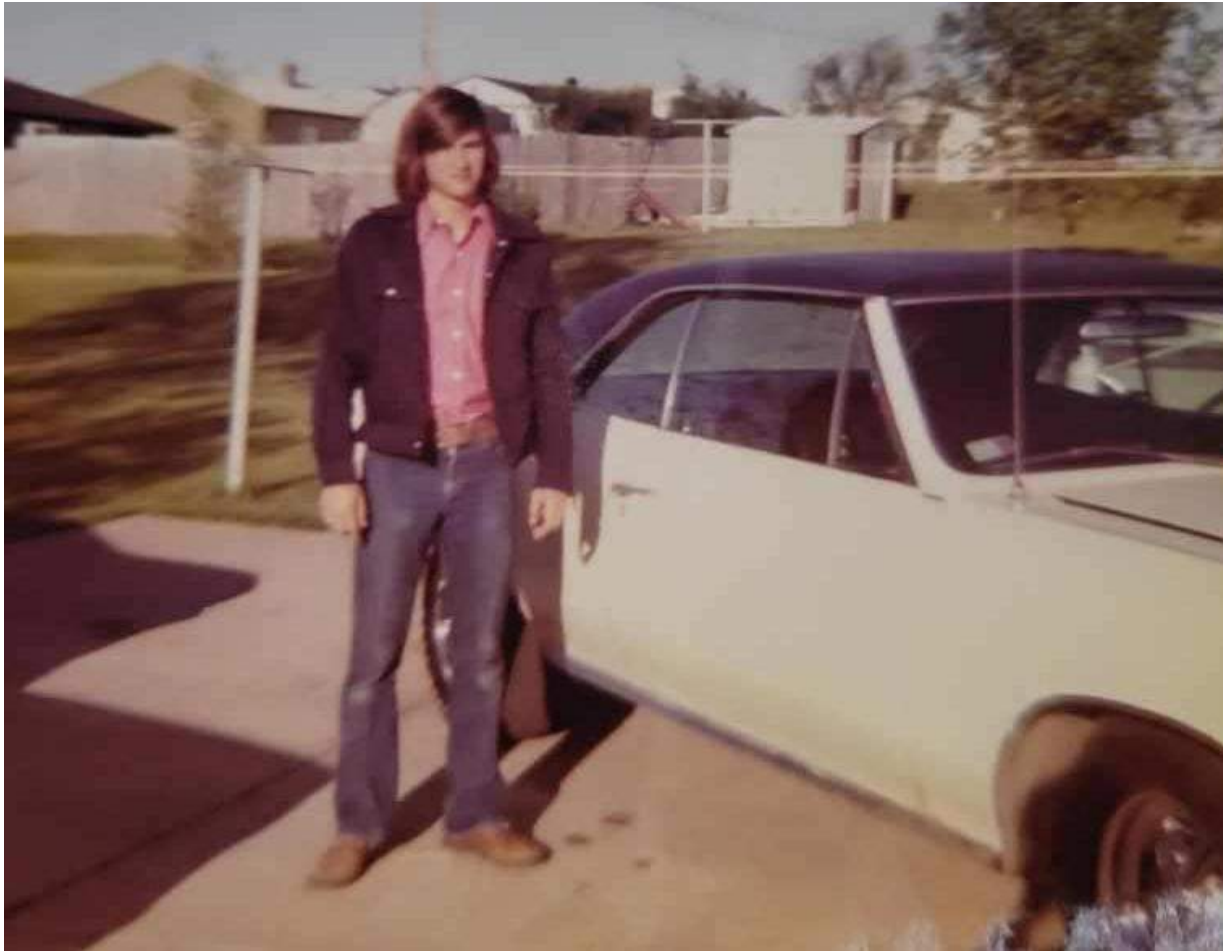
The last day of high school

Not to be my one and only Chevelle, years later during my young adulting life, a friend provided me a lead on a 1967 El Camino with a 396 and loaded with options. This car (or truck if you prefer) revived my Chevelle/ El Camino passion and would lead to many more projects over the years since. On a whim, a neighbor and I built a 1969 Chevelle Super Stock dirt track car that we ran for two years. This was certainly a bad decision for keeping Chevells alive for future generations. The weekly damage and work made me realize that I prefer making them pretty, rather than muddy and making junk parts. Please forgive me. Hopefully, some of my more recent projects have saved some Chevells and El Caminos, given them new life for others to enjoy, and made up for past deeds. I am looking forward to working on two more future project cars that are just waiting for my attention.