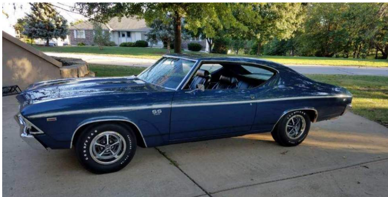
A current ride