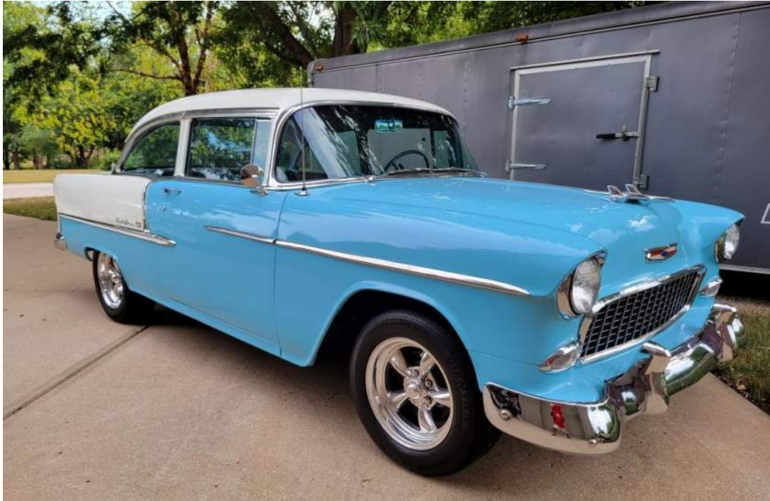
The family '55 today

In high school I was a proud kid with a Super Sport Chevelle. Life was good and many great memories were made with my buddies working on our cars and cruising HiBoy's on Noland Road and Peter's Drive Inn on State Avenue. A few drag racing passes down KCIR were also made. After heavy persistence from a good friend, I sold my Chevelle to him. He immediately installed headers and an L88 cam, making it a great street performer in the KC Northland.